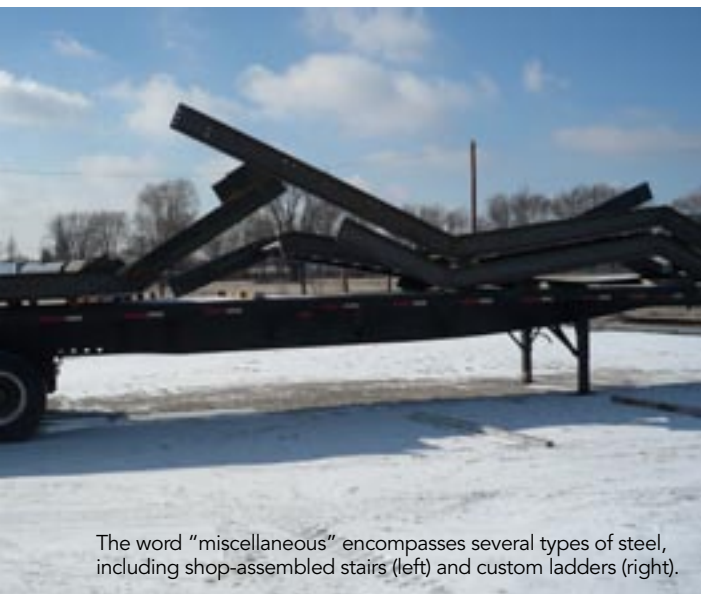
The word “miscellaneous” encompasses several types of steel, including shop-assembled stairs (left) and custom ladders (right).

The miscellaneous metals specialty has been in existence as long as construction in general but began in earnest with the development of cast iron at the beginning of the industrial revolution. Indeed, the first iron bridge built in the world, in 1779 in Coalbrookdale, England—which still exists today and is a national monument (now called Ironbridge)—is a large ornamental iron structural frame comprised of castings produced by the Darby Iron-